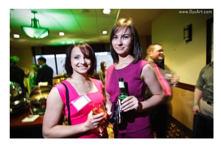
Visit our <u>facebook</u> page to view more photos.